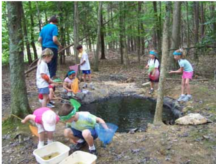
2009 Pre-School Nature Camp